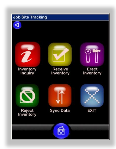
Simple User Interface

All of this can be efficiently accomplished using a mobile client, created to handle the receipt, location, erection and rejection of jobsite assemblies. As each event takes place, location data is entered into the mobile device.